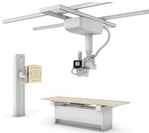
Figure 3 Example X-ray system