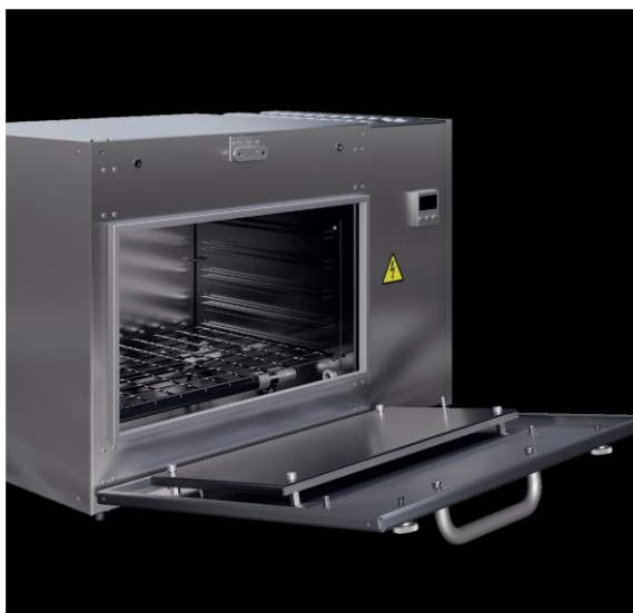
UV Chamber for disinfecting objects (surface disinfection)., Example of size: (L x H x W) 651 mm x 437 mm x 320 mm, appr. 26 kg, contain 4 UVC Hg low pressure lamps