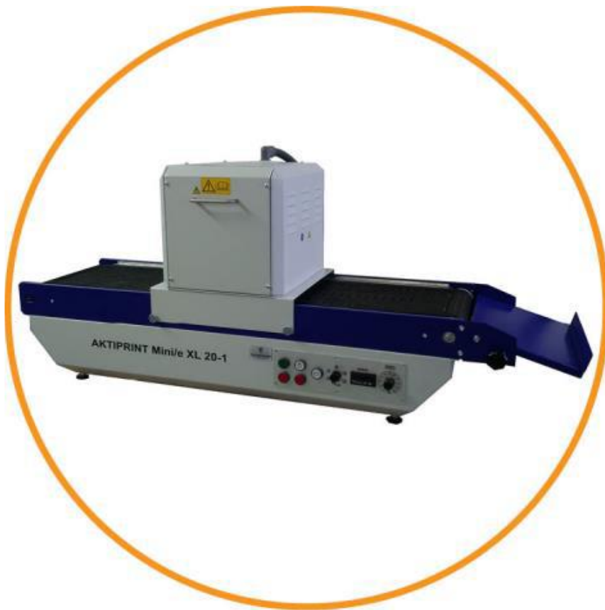
Belt dryer, continuous table-top device for rapid curing of UV Hg inks, UV coatings and UV adhesives in the small-format printing sector for testing or production on flat material and moulded parts, Example of size: (LxHxW) 105 x 40 x 50 cm, appr. 45 kg