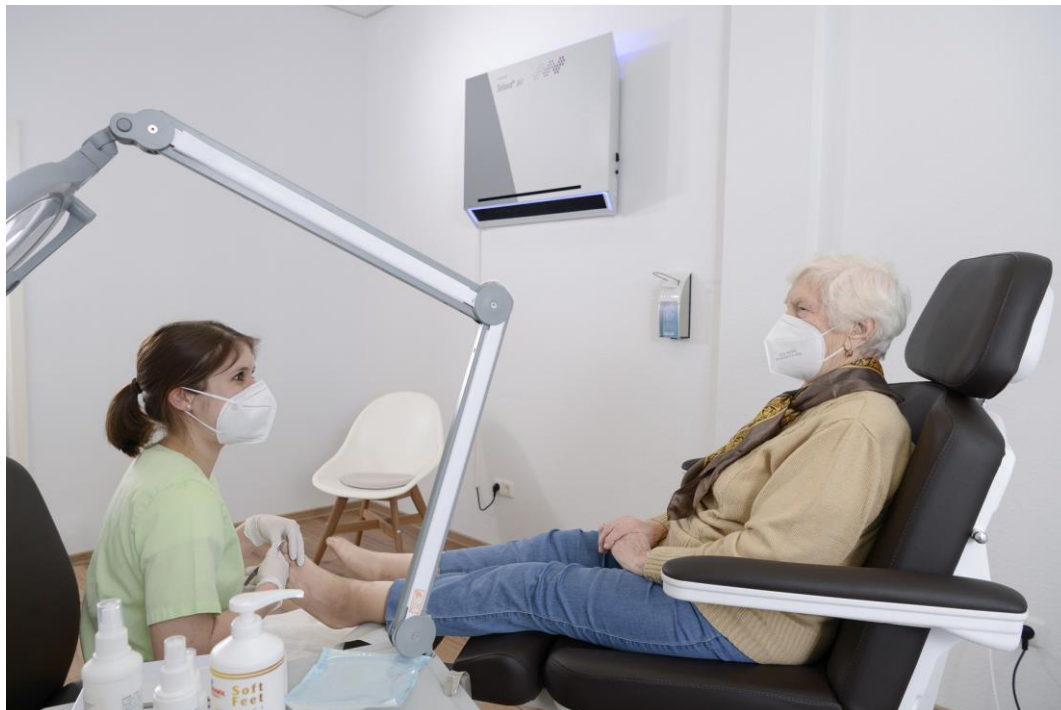
UV Air disinfection; Dimensions (LxHxW): 998mm x 685mm x 197mm, appr. 35 kg, UVC Hg low pressure lamp; Source: Heraeus