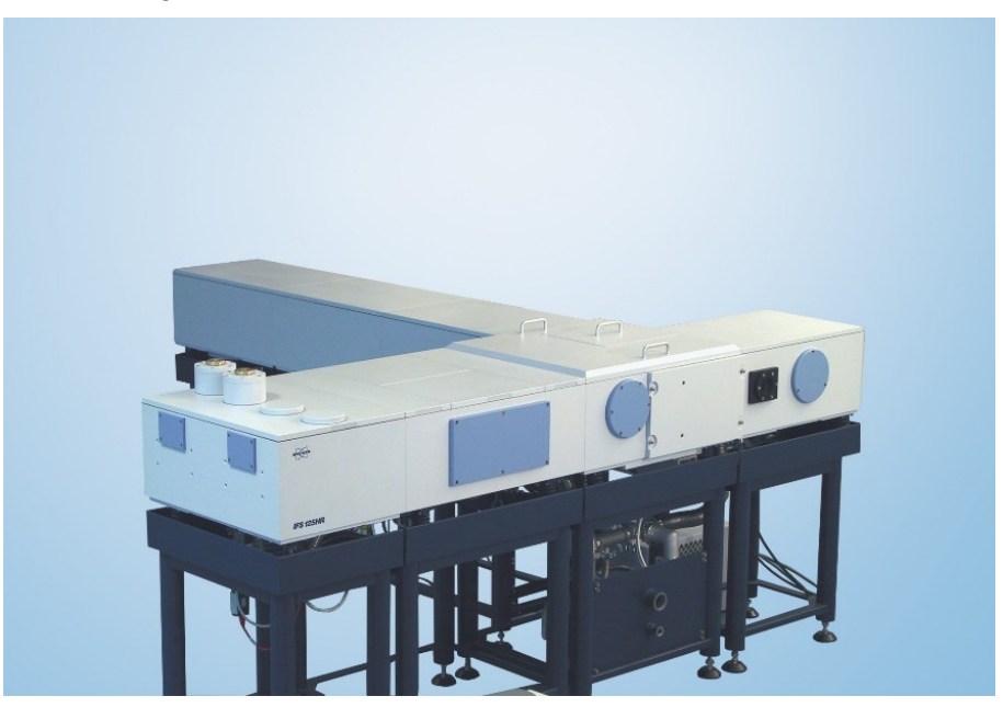
Figure 1: Bruker IFS125HR spectrometer for high resolution measurements (standard 0.007cm<sup>-1</sup>, optional 0.0009cm<sup>-1</sup>)

Spectral resolution is one of the most important attributes of spectrometers, since it defines the ability of the instrument to resolve the bands of close proximity, as required e.g., in atmospheric and climate research.