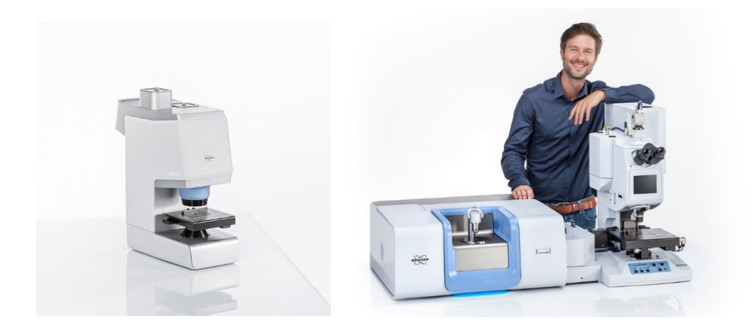
Figure 2: Bruker microscopes, left: Lumos II, right: Hyperion attached to an Invenio spectrometer

In infrared microscopy, sample areas are investigated with a spatial resolution down to a few micrometers. This typically reduces the available light level by several orders of magnitude compared to measurements without spatial resolution. MCT detectors are used by standard for microscopic analysis in the mid-infrared, either as a single element detector or as an infrared imaging camera (focal plane array detector) with thousands of pixels.